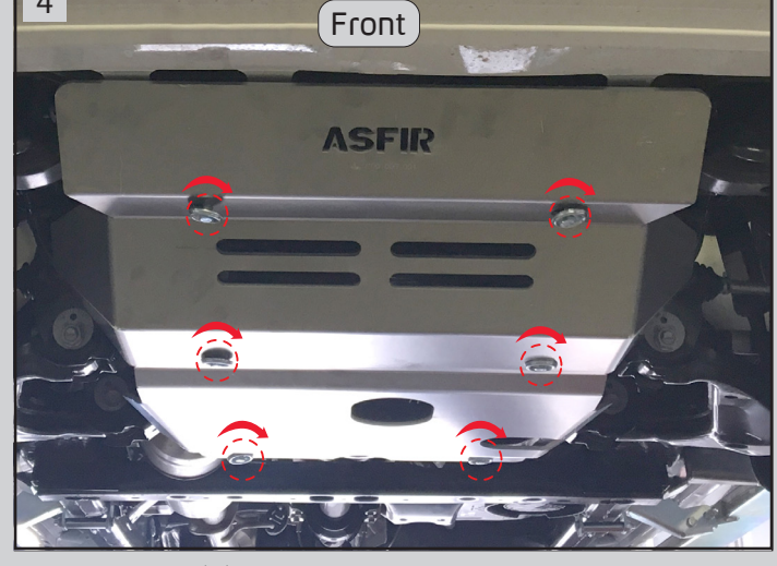
Connect plate (A) to the original screwing using 6 hex bolts (B) with spring washer (c) and pocket washer (D). Tighten the bolts