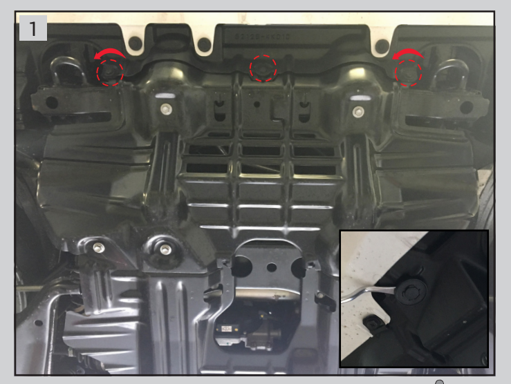
Remove 2 bolts and the middle clip