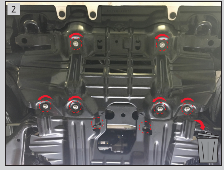
Remove 8 bolts and dispose the original plate